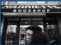
Harriet's Bookshop (Philadelphia, PA) OurSisterBookshops.com

When purchasing your book, we encourage you to support local Black owned bookstores in our area. Here are a few bookstores who are partners in our drive and would appreciate your business!