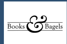
Books and Bagels (Wilmington, DE) BooksAndBagelsllc.com