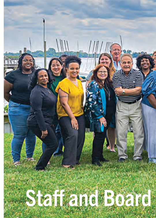
Staff and Board