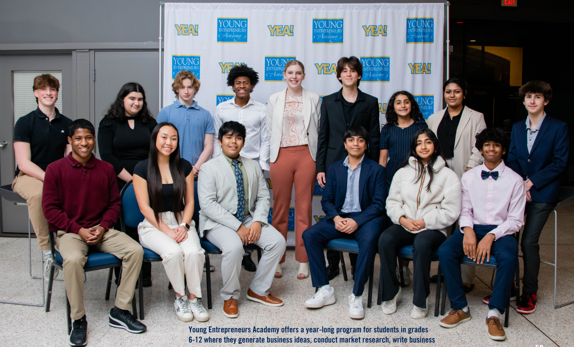
Young Entrepreneurs Academy offers a year-long program for students in grades 6-12 where they generate business ideas, conduct market research, write business plans, pitch to a panel of investors, and launch their very own companies.